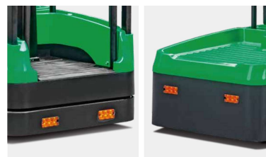
Front and rear flashing lights