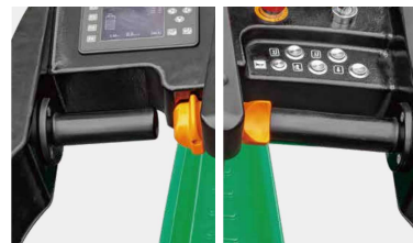
Right and left hand sensing